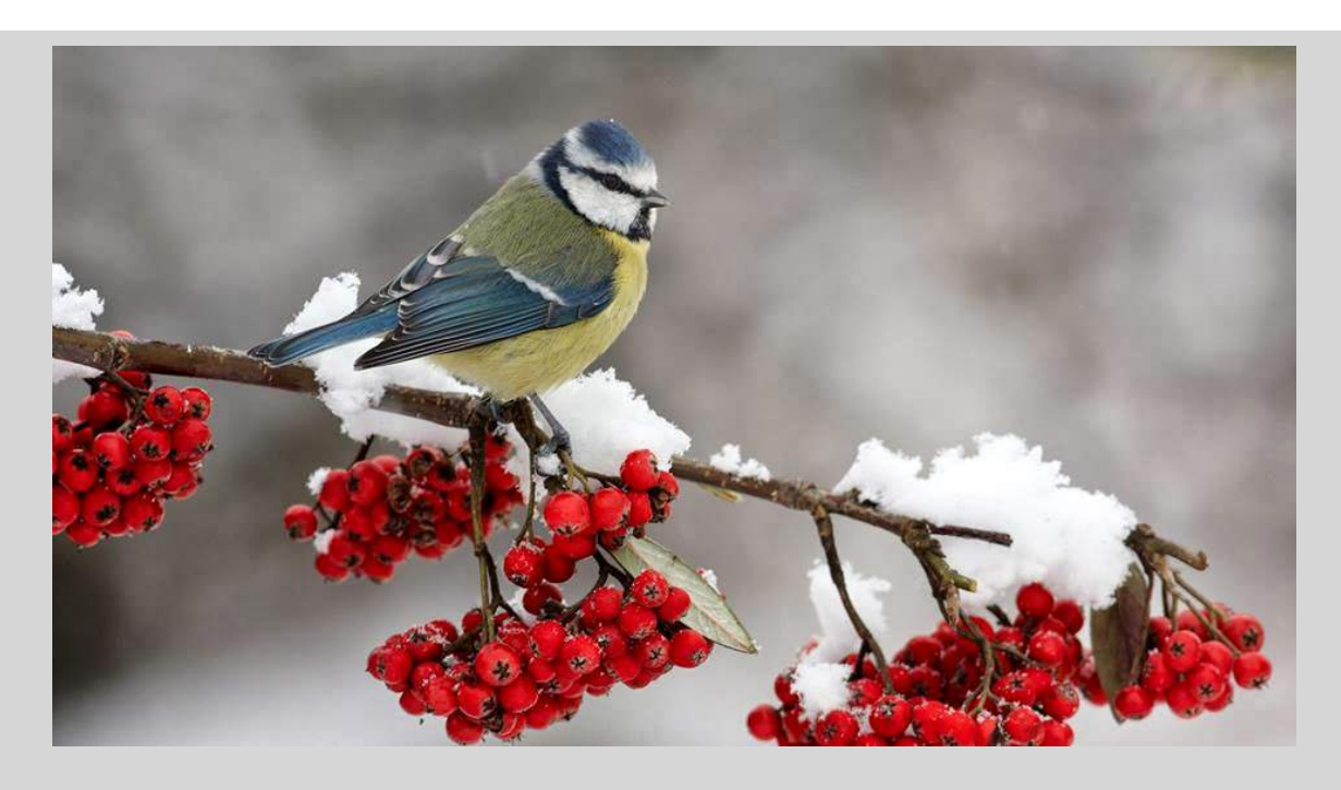
"Harvest Collection" - Issue 25, February 2020